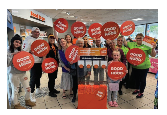
Napier Support Group and Z Kennedy Road